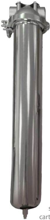
SRVC single cartridge