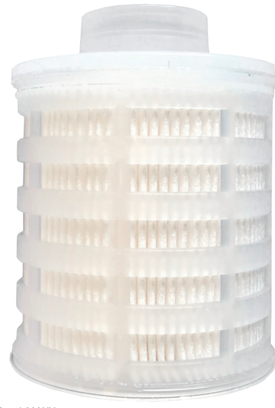
Brevi-MAXX compact pleated cartridge

The smaller size of the Brevi-MAXX helps to reduce hold up and increase yield of valuable products compared to larger sized filters. Pilot plant trials easily scale up from this size to other formats. Utility applications where "drops" are made to various points-of-use might use a Brevi-MAXX filter at each POU. This is also a nice compact size for OEM equipment. Depending on the specifics of the application, this size filter might typically be used for liquid flow rates <2 lpm, compressed air flow rates of <25 SCFM or for tank venting at flow rates of <10 CFM. These filters also retrofit many competitors' smaller housings.