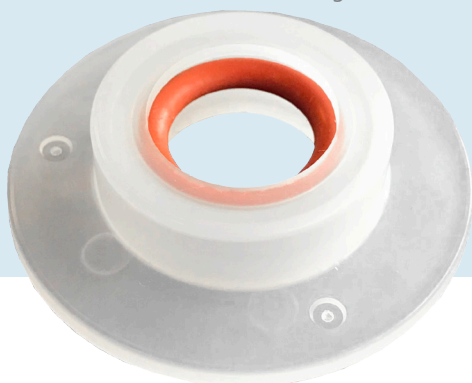
C12 (116 flat O-ring)