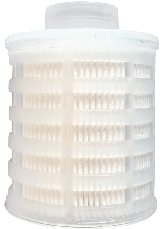
Brevi-MAXX compact pleated cartridge

The smaller size of the Brevi-MAXX helps to reduce hold up and increase yield of valuable products compared to larger sized filters. Pilot plant trials easily scale up from this size to other formats. Utility applications where "drops" are made to various points-of-use might use a Brevi-MAXX filter at each POU. This is also a nice compact size for OEM equipment. Depending on the specifics of the application, this size filter might typically be used for liquid flow rates <2 lpm, compressed air flow rates of <25 SCFM or for tank venting at flow rates of <10 CFM. These filters also retrofit many competitors' smaller housings.