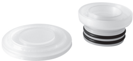
Code 3 (C3) Flat/222