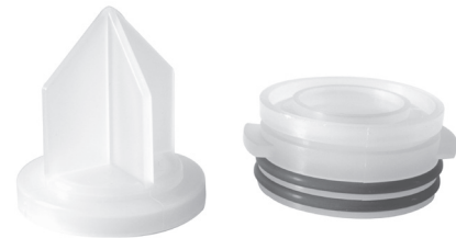
Code 7 (C7) Fin/226