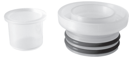
Code 5 (C5) Recessed Cup/222