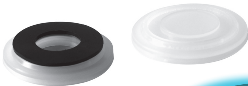
Code 4 (C4) Single Open End/Flat Closed End