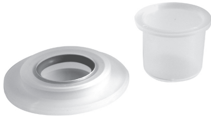
Code 2 (C2) 213/Recessed Cup