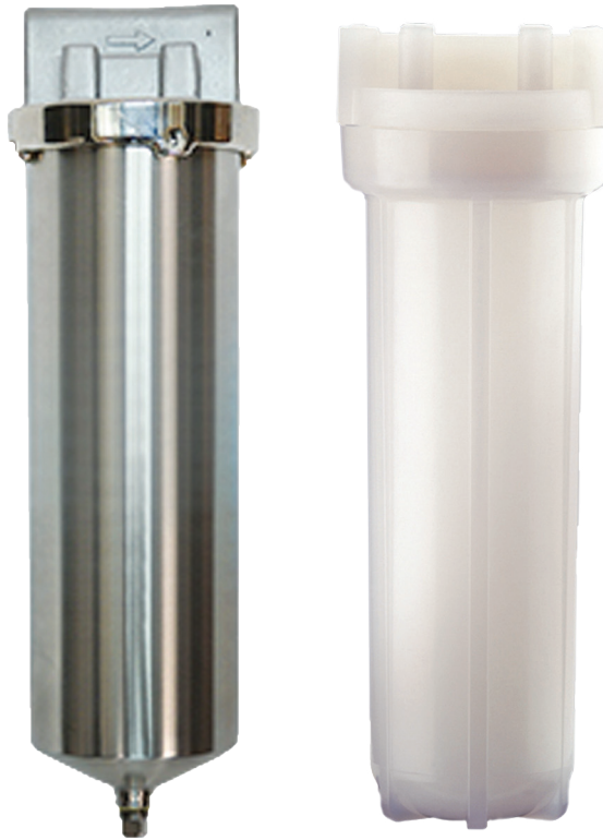
SRCI single cartridge

With a radial seal, the SRC has a machined surface that produces a positive seal to eliminate bypass. The SRC vessel line is raising the bar in the Original Equipment Manufacture market by delivering superior value in a cost-effective design.